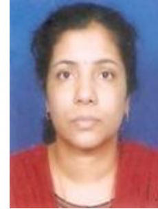
HOD Civil Engineering Dept.