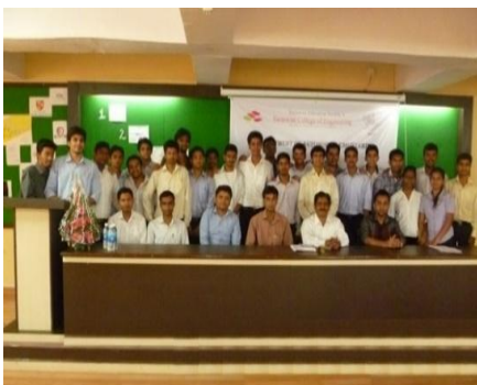
CHIEF GUESTS WITH THE R.A.C.E. TEAM