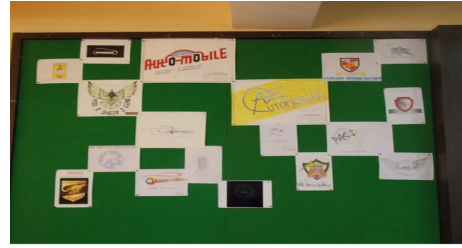
LOGO COMPETITION PARTICIPANTS

2. Logan Competition was held by RACE on 5 th April 2013.