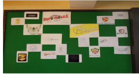
LOGO COMPETITION PARTICIPANTS

2. Logan Competition was held by RACE on 5 th April 2013.